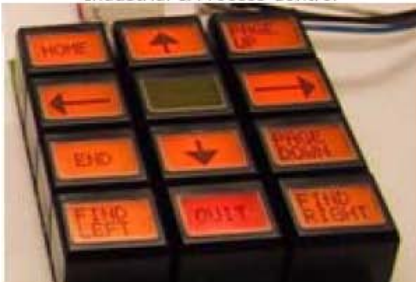
Industrial & Process Control