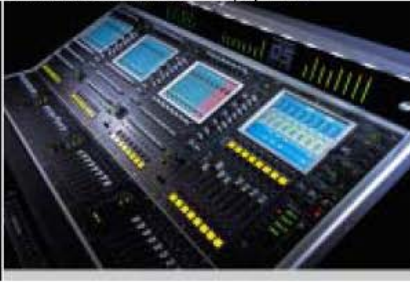
Audio/Video Production Equipment