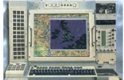
Military & Aerospace Systems