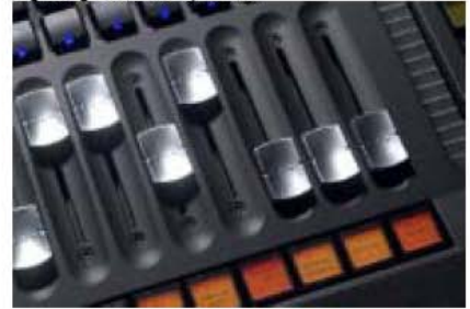
Lighting Control Systems