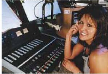
DJ Control Systems